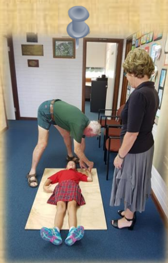
Assisting Men in Sheds with a project they are doing to recognise our volunteers in the community.