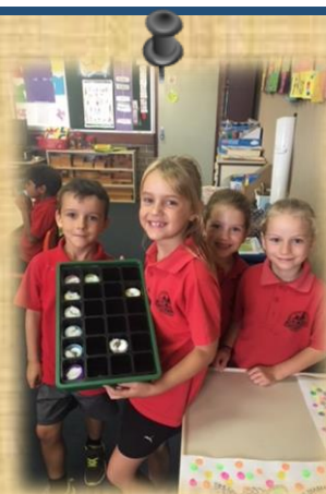
Room 11 learning about sustainability – recycling egg planters with carrot seeds.