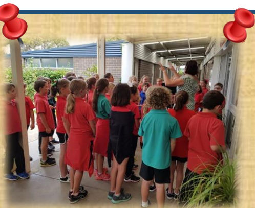
Being serenaded by our Choir!